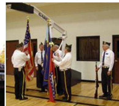
Veterans Day Ceremony at Quitman Schools

A great turnout at the Veterans Memorial in Spring Park November 11, 2016.